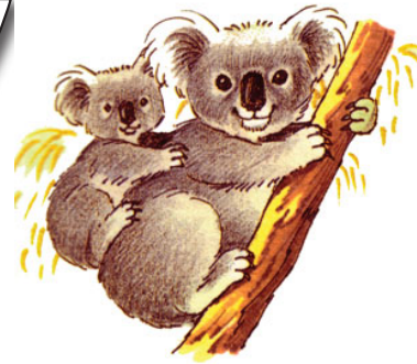
The Australian Koala